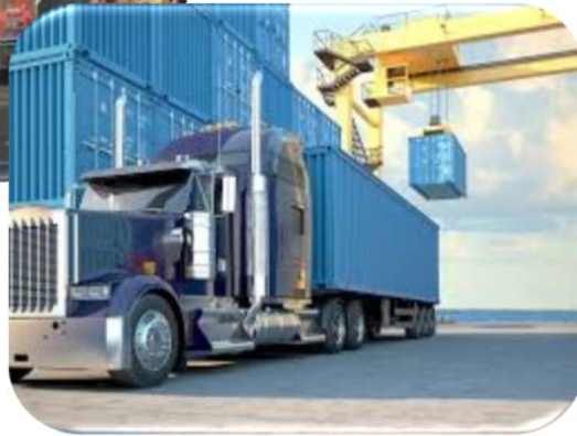
Diesel Trucks - currently 2007 or 2010 MY engines