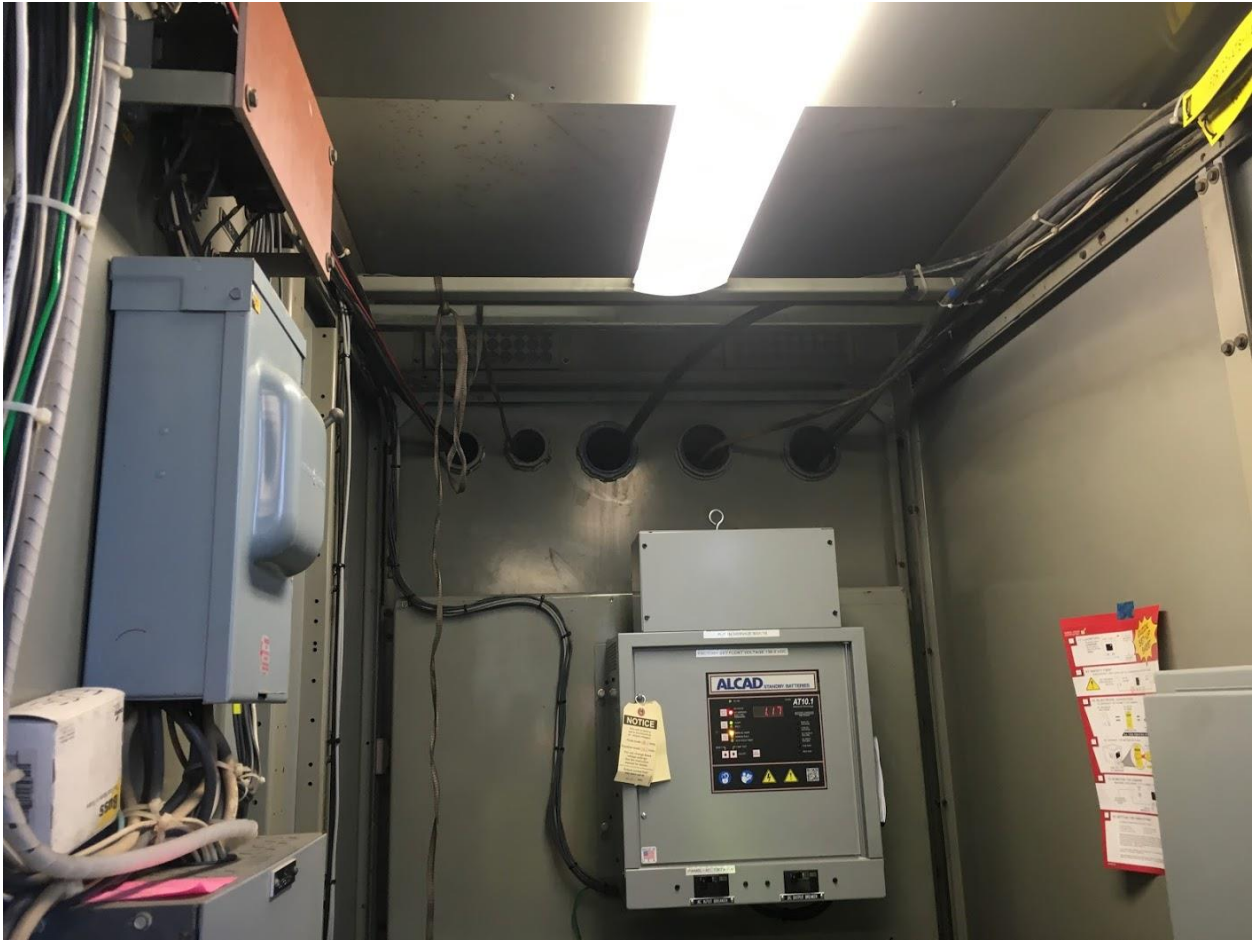
Conduits entering SS1. Fiber enclosure will be mounted on the left wall. (Point 1 on the aerial photo)