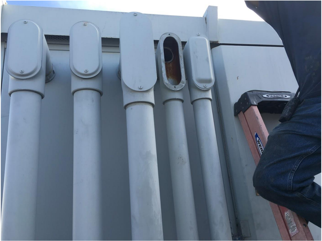
Conduits entering SS1 (Point 1 on the aerial image)