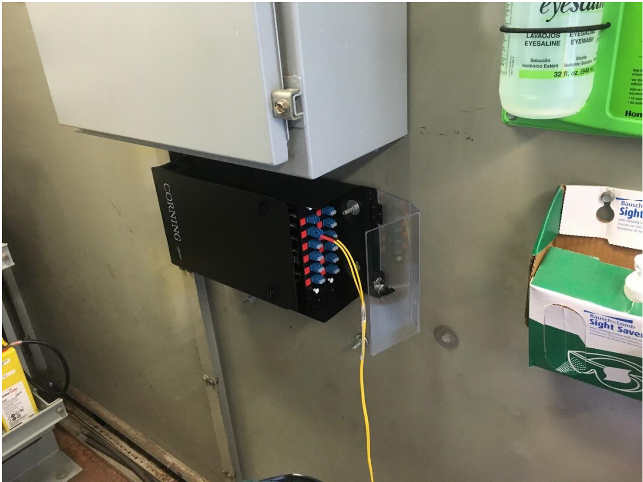
Existing fiber in SS1. The new enclosure will be installed on the same metal wall.