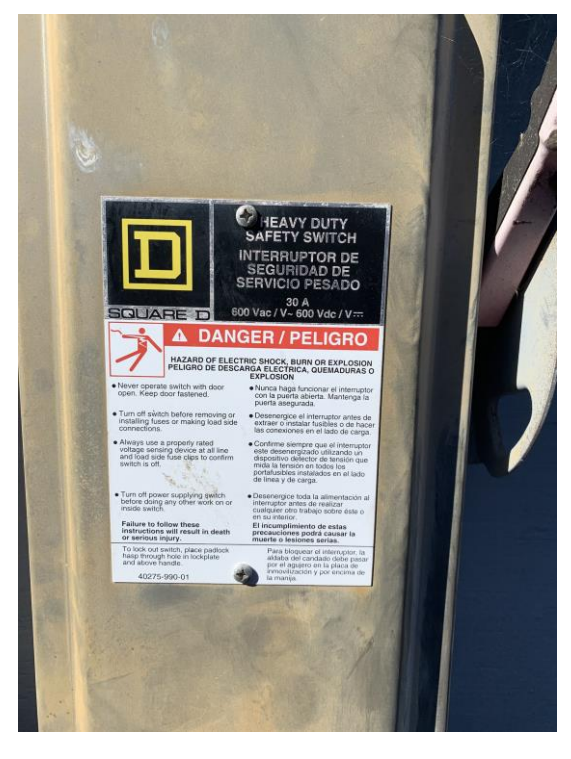
Bid 18-19/10, Enclosure B, Existing Compactor Photos, Page 1 of 2