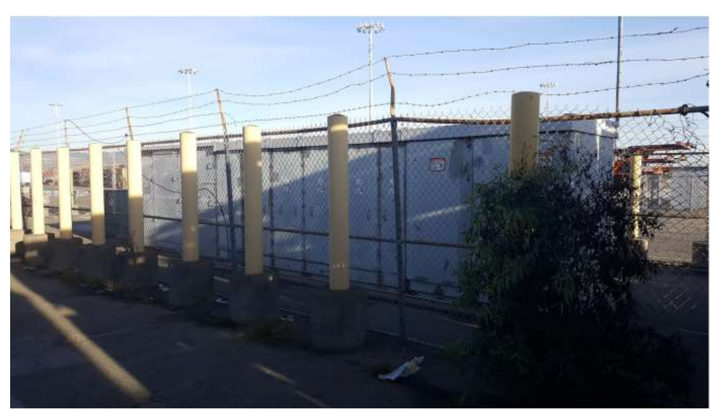
Rear View 1