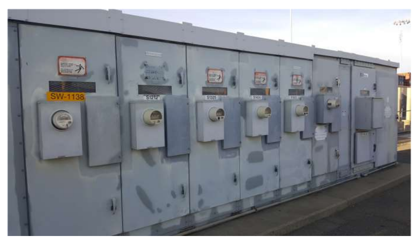
Front View 3