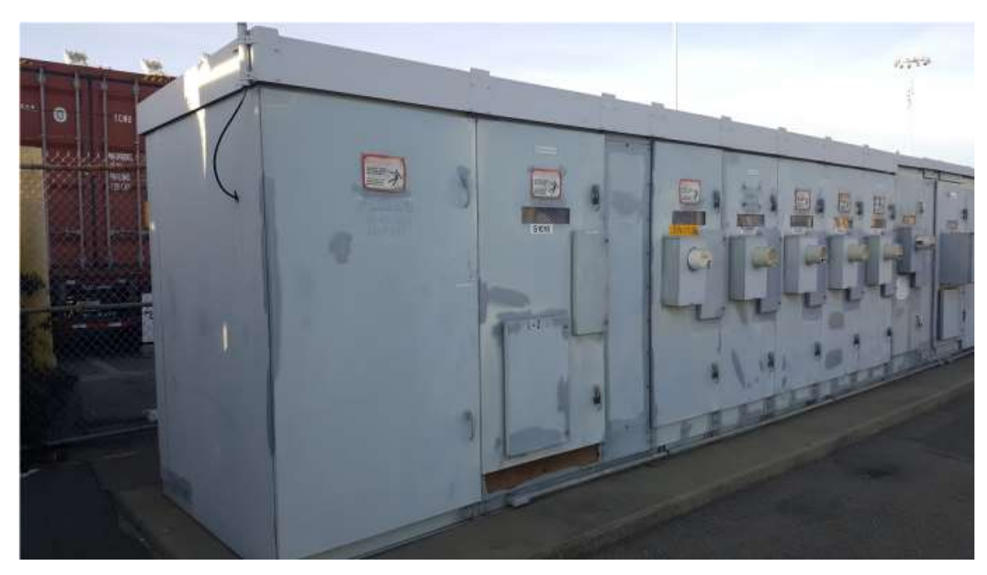
Front View 2