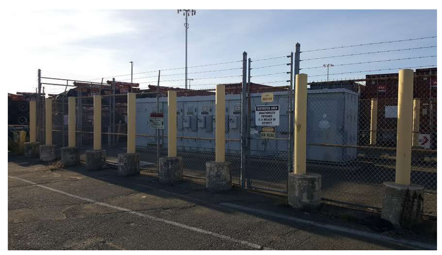
Front View 1