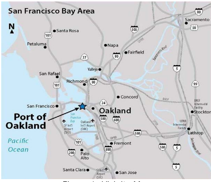
Figure 1: Vicinity Map

The Oakland seaport serves as the principal ocean gateway for international containerized cargo shipments in Northern California, and is one of five major gateways on the West Coast of North America. The seaport is the seventh busiest container port in the U.S.; approximately 2.4 million TEUs (twenty-foot equivalent units) were handled in 2016. The seaport complex comprises approximately 1,300 acres, including approximately 770 acres of marine terminals, numerous transload/warehouse companies and is served by two Class I railroads: BNSF Railway and Union Pacific (UP) Railroad. A robust roadway transportation network also supports seaport activities: access to I-80, I-880 is less than 1 mile from proposed development site with other additional roadway corridors nearby including the I-580, I-980 and State Route 24. Together with its business partners, the Port supports more than 73,000 jobs in the region and nearly 827,000 jobs across the United States. The Port is an independent department of the City of Oakland.