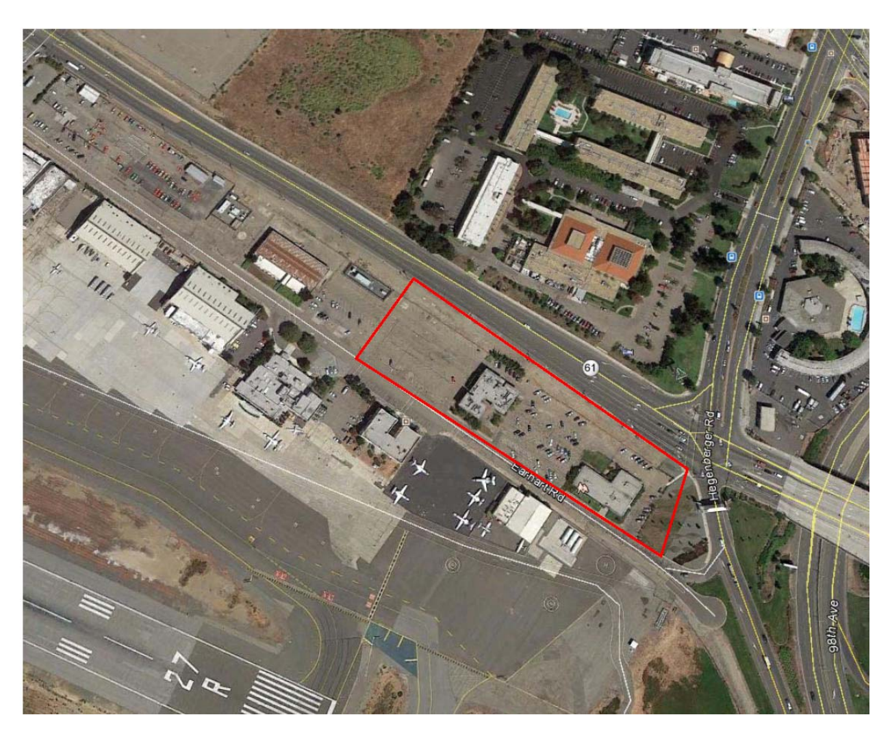
Southwest corner of Hegenberger Road and Doolittle Drive, Oakland, California