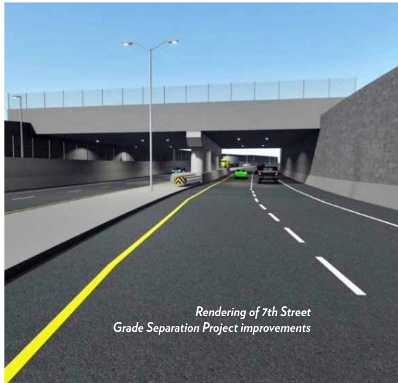
Rendering of 7th Street Grade Separation Project improvements

“Through the hard work and dedication of civil servants at the local, regional, state, and federal levels, today, we are kicking off a long-overdue improvement to West Oakland that will not only strengthen the efficiency and economic competitiveness of our Port but also bring health, safety, and mobility benefits to our historically underserved West Oakland residents,” shared Mayor Thao. “This is a great example of the types of win-win-win solutions we can accomplish when we work together, and we are so thankful to have the support of so many regional, state, and federal partners.”