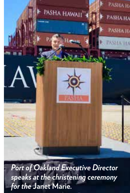
Port of Oakland Executive Director speaks at the christening ceremony for the Janet Marie.