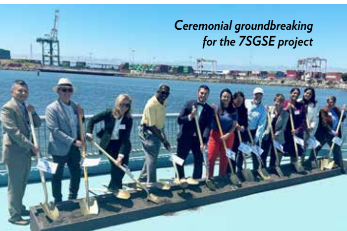
Ceremonial groundbreaking for the 7SGSE project