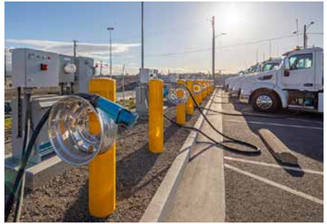
The new clean energy substation will support electric cargo handling equipment such as electric truck chargers at the Oakland Seaport.

In 2019, the Port approved a bold initiative to create a zero-emissions seaport. The Seaport Air Quality 2020 and Beyond Plan provides the strategy and process for the transition from a fossil fuel-based seaport to a zero-emissions seaport. Providing electrical infrastructure systems to support zero-emissions equipment and operations is essential to decarbonizing the Oakland Seaport and delivering air quality and community health benefits. The Port is continuing to work with regional, state and federal partners to advance and implement clean energy and zero-emissions initiatives throughout the Port. ●