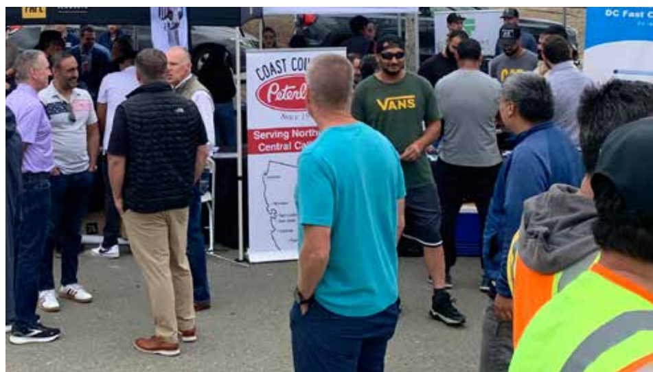
Below, right: Many enjoyed the event and the opportunity to learn about the future of trucks and trucking.