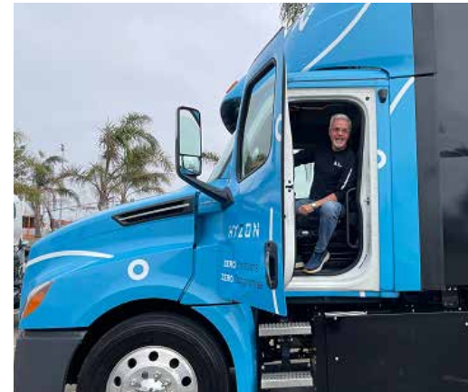
Above, left: Driving a ZE truck