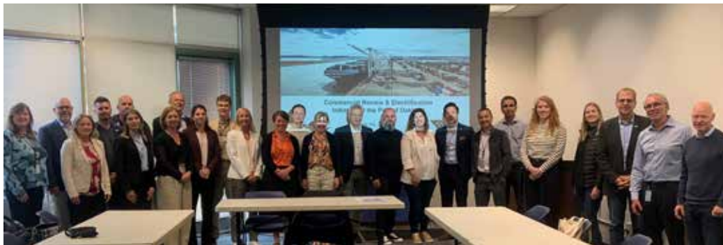
The Port's efforts towards zero emissions are receiving international attention. Dutch (above) and Swedish (left) delegations visited the Port this month to exchange presentations/comments/discussion and tour the seaport to learn about zero emissions programs.