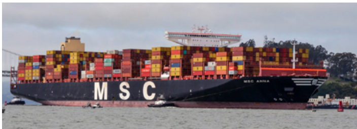
MSC Anna arriving at Oakland in April

Last month, MSC sent one of its 19,000+ TEU megaships to the Port of Oakland. Another similar-sized containership is expected to call at Oakland in June. The Port continues to show customers around the world it can accommodate some of the largest vessels with its deep harbor, taller cranes and skilled workforce.